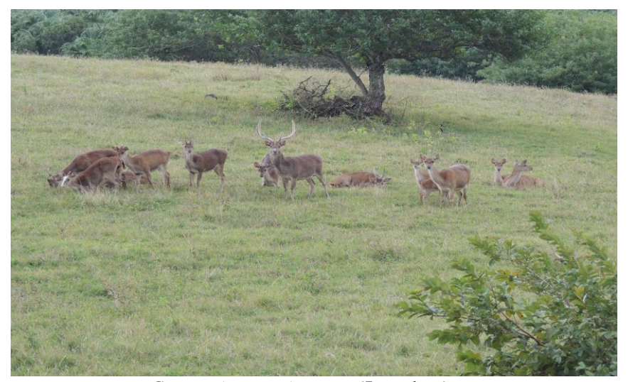
Cervus timorensis russa (Java deer)

It is worthy to note that considerable damage is caused to both planted and native forests by this activity, through ring-barking of adult trees and uprooting or trampling of seedlings. Frequent meetings are held with all concerned parties to ensure that deer ranching activities are carried out in a sustainable way with least impacts on the environment.