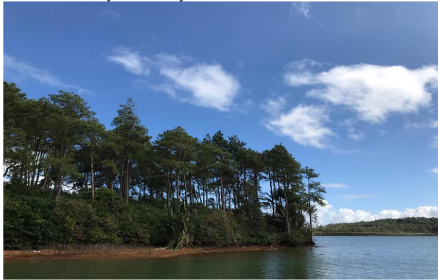
Catchment areas around Mare aux Vacoas reservoir

Although privately-owned, the extent of mountain and river reserves, amounting to some 6,540 ha, is protected under the Forests and Reserves Act of 1983 and is under constant surveillance by the Forestry Service.