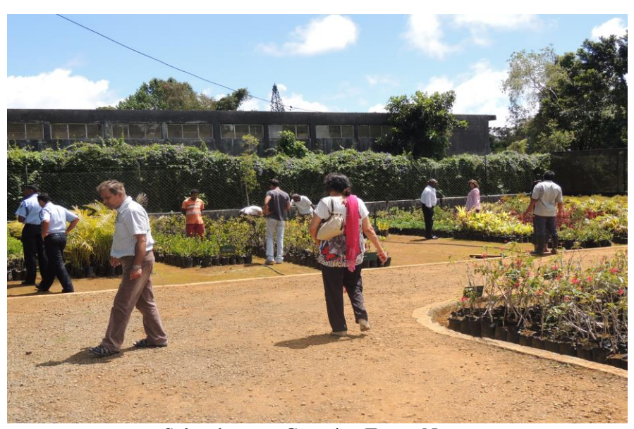
Sales depot at Curepipe Forest Nursery