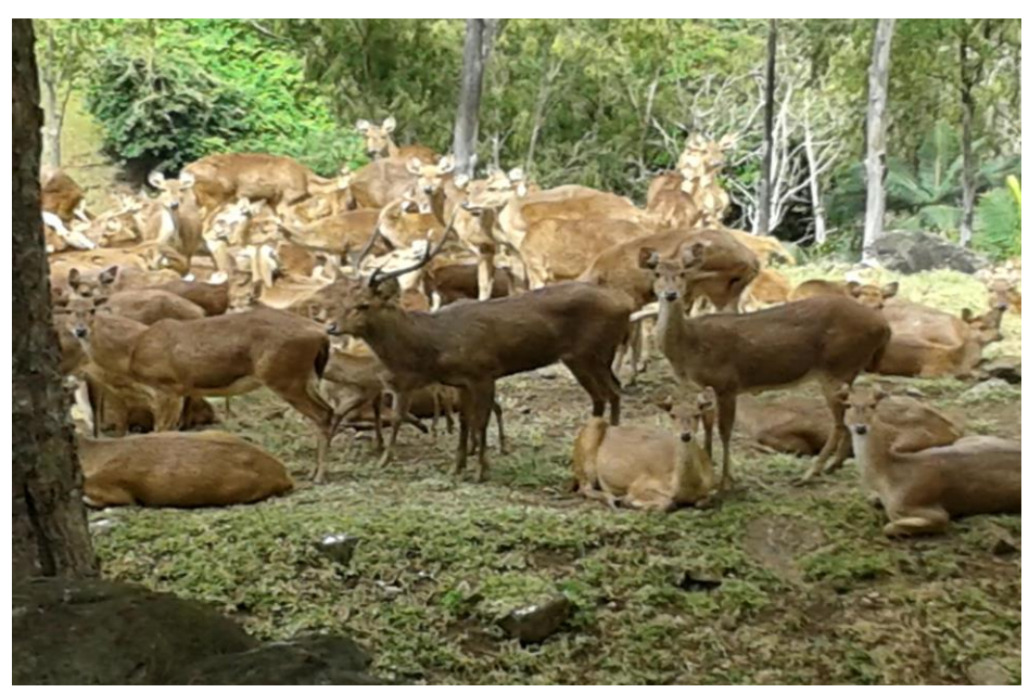
Java deer ( Cervus timorensis russa )

3.5 Rats continue to cause significant damage to pine seeds as well as to seeds of both exotic and indigenous species. They also destroyed the eggs of native birds.