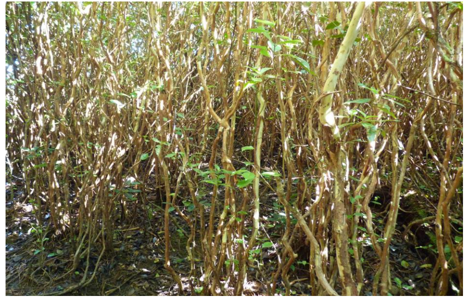
Psidium cattleianum thicket

Consequently, timely weeding is required for the successful establishment of plantations, especially for native species.