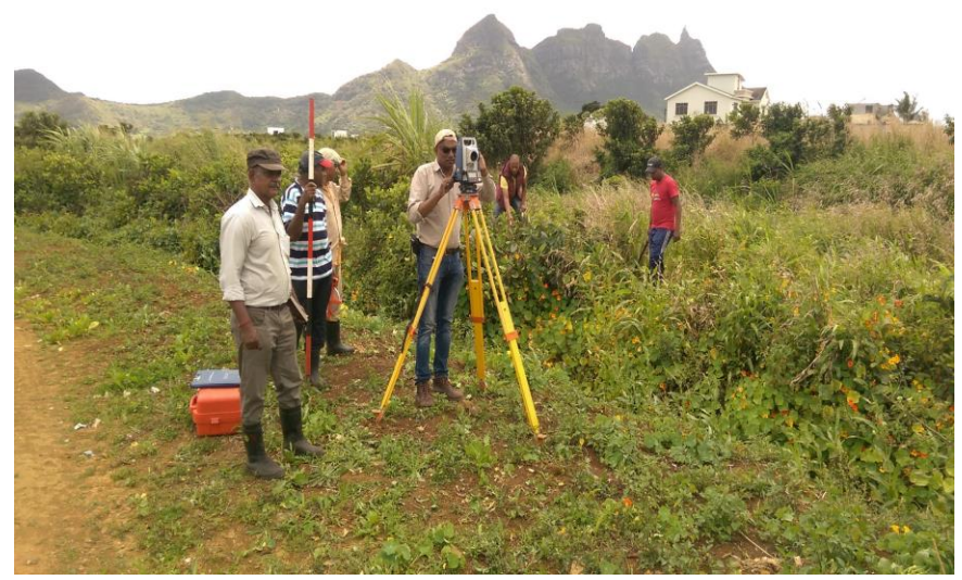
The survey team at work