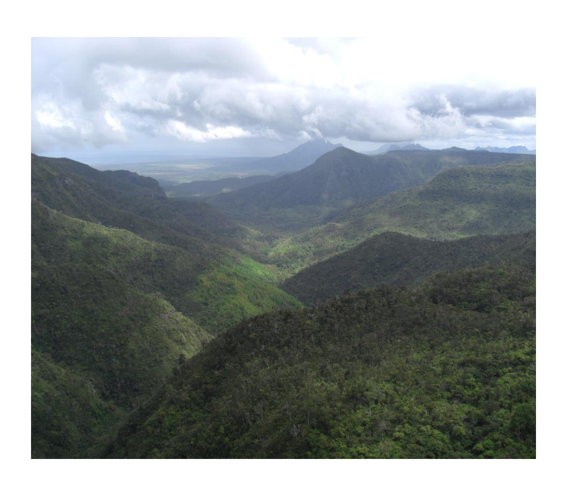
Forestry Service Botanical Garden Street Curepipe