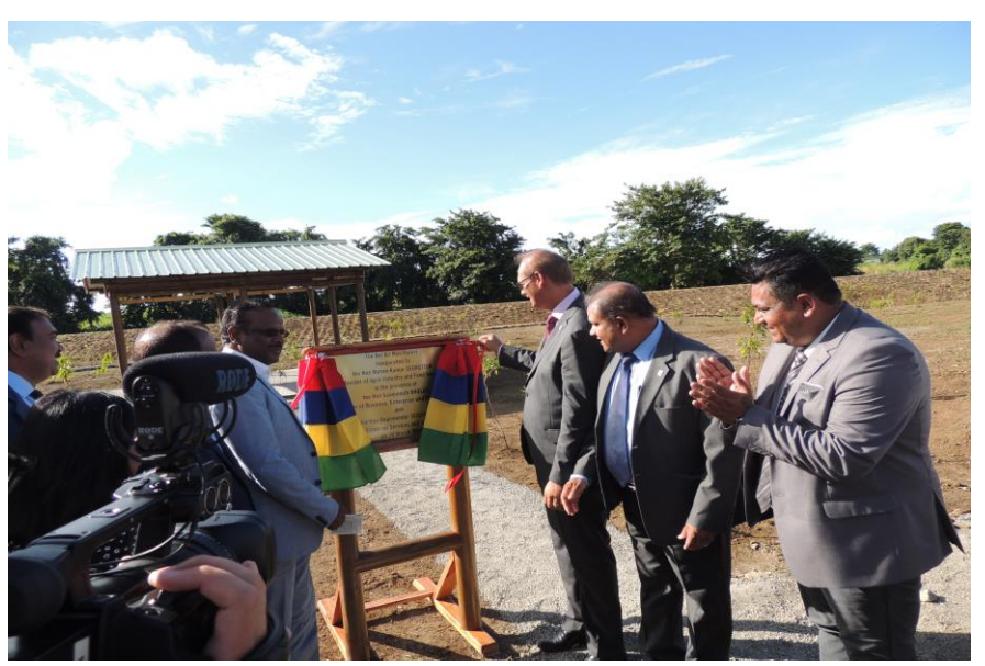
Inauguration plaque unveiling by Hon. M.Seeruthun, Minister of Agro-Industry & Food Security

In the context of the International Day of Forests 2018, the Forestry Service, under the aegis of the Ministry of Agro-Industry & Food Security, officially inaugurated a mini forest at Bel Air SSS on 21 March 2018. To mark this event, different activities and awareness campaigns were initiated by the Forestry Service, including distribution of pamphlets, posters and plants free-of-charge.