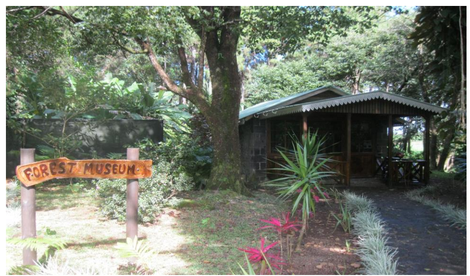
Forest Museum at Plaine Sophie, near Mare aux Vacoas