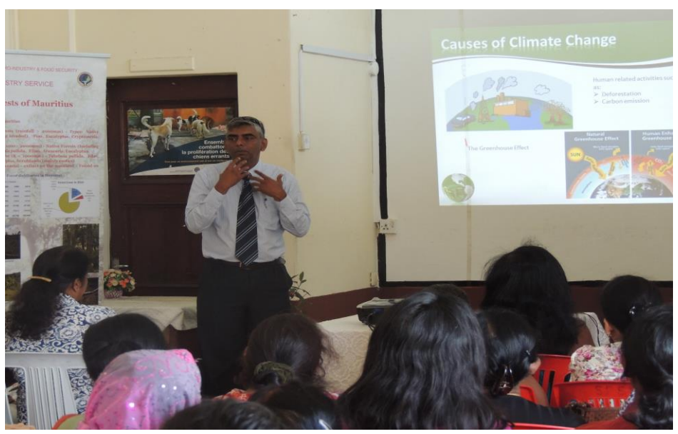
Raising awareness of the public through talks on the important roles of forests

6.3 This Service continued its sensitization campaign with a view to enlist the support of youths and the population in general in the daunting challenge to conserve, protect and propagate the rare endemic/indigenous fauna and flora. Officers of this Service gave talks on forest conservation, biodiversity conservation, and causes/effects of climate change, supported by power-point presentations, in various schools around the island. Monitoring of endemic gardens was carried out in (9) nine academic institutions. Moreover, awareness-raising programmes continued to be effected at the various Nature Walks.