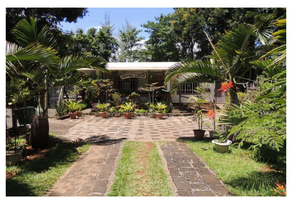
Powder Mills Visitors' Centre, at Pamplemousses

7.2 The Vallée D'Osterlog Endemic Garden of an extent of 275 hectares extends from the bottom of Vallée D'Osterlog to the Créole Mountain Range, including Mountain Laselle, Montagne Lagrave, and is astride the districts of Moka and Grand Port. The Garden contains several critically endangered species and some of the rarest indigenous/endemic species. It is managed by The Vallée D'Osterlog Endemic Garden Foundation. Its main objective is to inform and sensitize visitors on the rich endemic flora and fauna of Mauritius.