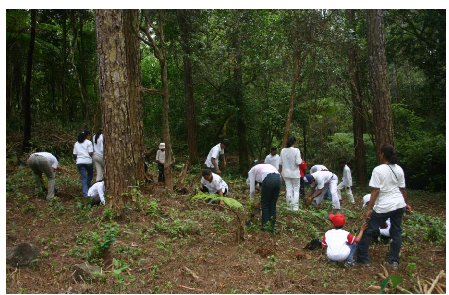
Tree-planting by NGOs under the NTPC

The National Tree Planting Campaign was officially launched by this Ministry in 1985. In this scheme, the Ministry approved the distribution of plants free of charge to Government institutions, parastatal bodies, schools and socio-cultural, religious & youth organizations to encourage tree planting throughout the island with a view to embellish the island and enhance the environment. Some 29,745 plants were issued free of charge to various organizations under this scheme during the year under review.