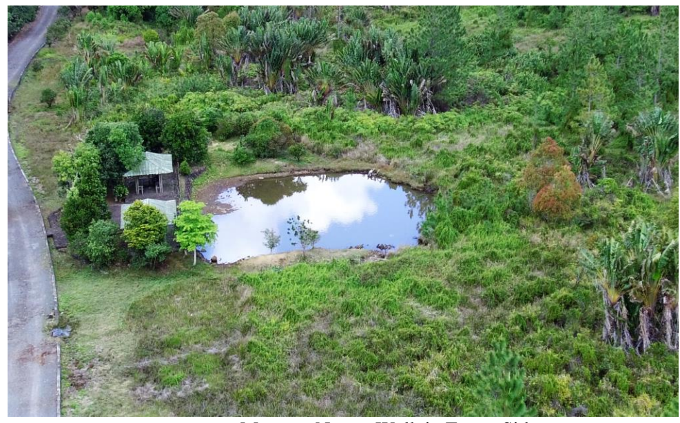
Monvert Nature Walk in Forest Side

Monvert Nature Walk comprises a Visitors Centre and a fernery where a live display of native ferns and orchids can be contemplated. Sophie Visitor's Centre also includes a Forest Museum, where ancient forestry tools and accessories are displayed.