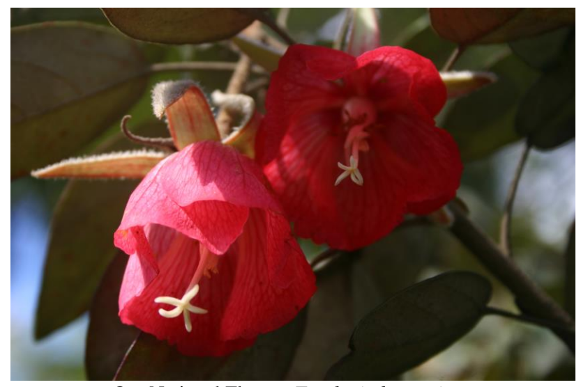
Our National Flower, Trochetia boutoniana