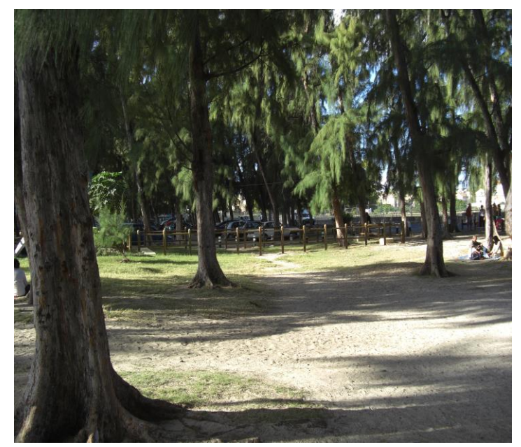
Casuarina equisetifolia plantation on Pas Géométriques

1.6 The total area of Pas Géométriques is about 2,110 hectares. Most undergone have change in land use and are now leased for bungalow and hotel sites. Proclaimed and unproclaimed public beaches occupy a fairly large area around the island. The area of Pas Géométriques under the control of the Forestry Service was only 606 hectares at the end of the year under review.