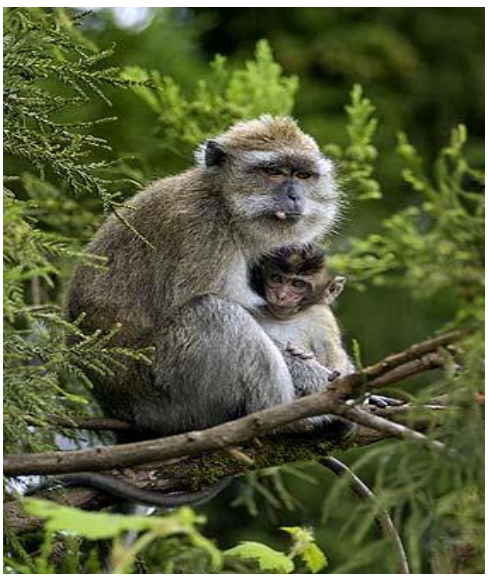
Macaca fascicularis (monkey)

3.3 Monkeys ( Macaca fascicularis ) are still causing damage to plantations by ringbarking trees. In the absence of cyclones, their population is on the rise. They continue to be a major pest in the native forests by eating the fruits and seeds of forest trees and preying on the eggs and youngsters of native birds.