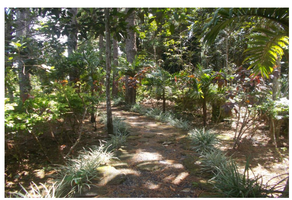
Sophie Nature Walk, near Mare aux Vacoas

During the year 2018, some 19,128 tourists and locals visited these Nature Walks and some 52 guided tours by Forest Officers were proposed to visitors.