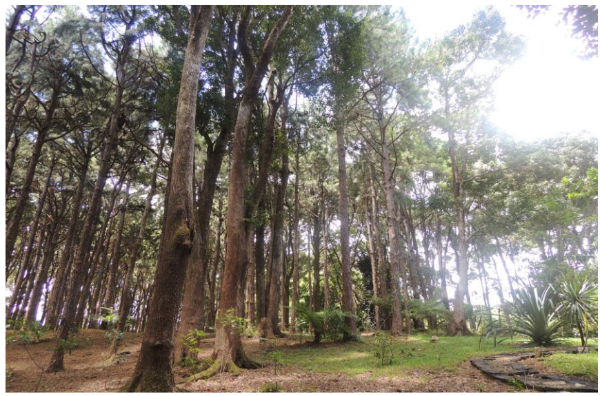
Mixed plantation at Plaine Sophie